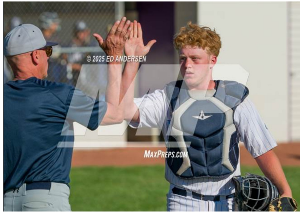
Varsity catcher / team leadership

These images are included only as context for the story told in the formal documentation: athletics, entrepreneurship/content, outdoor identity, and international perspective.