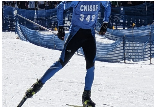
Nordic skier / biathlete